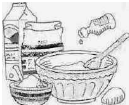
The only missing ingredient is you.