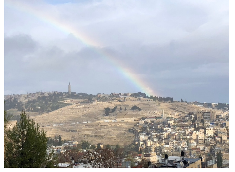
The Mount of Olives in Jerusalem

and King David choosing a 'mountain' (Mount Zion), in Jerusalem to place the Ark of the Covenant. That site is identified with the same mountain where Abraham proved willing to take the life of his son, Isaac as an offering to God. It is also the same place that King Solomon constructed the Jerusalem Temple. Indeed, Jerusalem, the Holy City, is a city 'built on a hill'. Jerusalem covers several hills often called 'mountains' or 'mounts', for example, the Mount of Olives