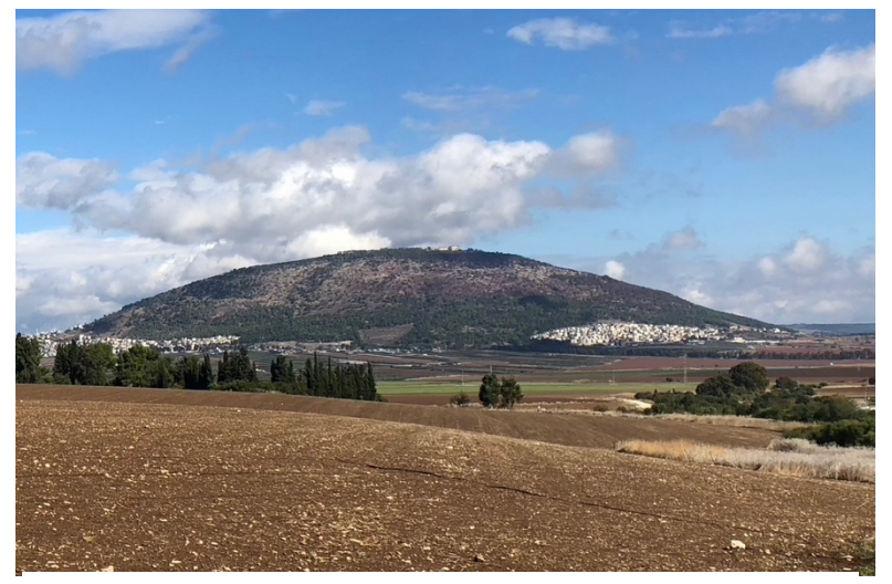
Mount Tabor in Galilee